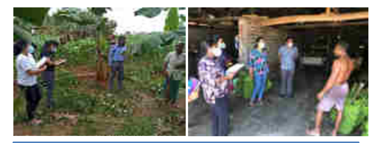
Gathering data from different stakeholder groups of the supply chain

During the past two decades The National Institute of Post Harvest Management carried out different activities to improve the post harvest sector of perishables. However, no studies have been conducted so far to determine whether there has been a positive growth in the postharvest sector. This research was initiated to identify current postharvest practices and losses in a more generalized form which represent the whole scenario of supply chain of fruits and vegetables. Therefore, the National Institute of Post Harvest Management (NIPHM) is planning to carry out a study on present status of postharvest practices, loss assessment and determination of the pesticide residual levels present in selected agricultural food crops. The project will be conducted for selected grains (paddy and maize), fruits (guava, papaya, pineapple, avocado, rambutan) and vegetables (carrot, capsicum, cabbage, tomato, beet root, bitter gourd, green chilli, long bean, brinjal) and big onion, where these data are not available or out dated. Financial allocation for the research (2021) was Rs. Mn. 1.438 and the expenditure was Rs. Mn. 0.082. Physical Progress 55%. Project duration 2 years, 2021 and 2022. Total allocation for the research is Rs. Mn. 4.892. Project duration 3 years.