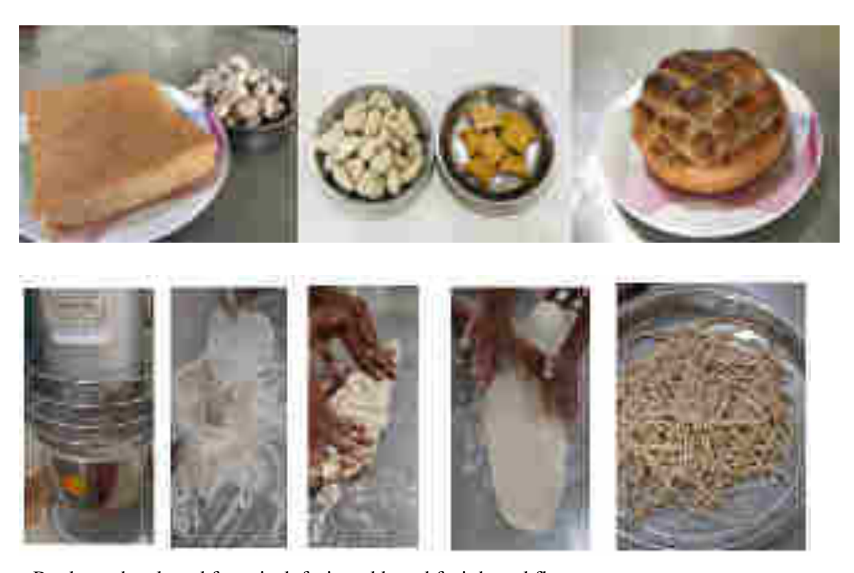
Products developed from jack fruit and bread fruit based flour

In Sri Lanka, there is a considerable post-harvest loss prevailing in Jackfruit bulbs, jackfruit seeds and breadfruit due to perishable nature and short shelf life and there is a current need of extending the storage period of these crops. There is a huge potential of substituting wheat flour with jackfruit bulb flour, seed flour and breadfruit flour which increase the nutrient content of the final product. And also value addition to that flour will create a demand for cultivating jackfruit and breadfruit in Sri Lanka. The proposed research aims to study the ability to produce the composite flour by incorporating jackfruit bulb flour, seed flour and breadfruit flour into wheat flour and identify the most appropriate ratio of wheat flour and jackfruit bulb flour, seed flour and breadfruit flour to examine its performance in bakery items production and other cottage level products like Noodles. This research will be continuing in 2022 too. Total allocation for the research (2021) was Rs. Mn. 0.071 and the expenditure was Rs. Mn. 0.049. Total financial allocation- Rs. Mn. 0.11. Project duration 2 years, 2021 and 2022.