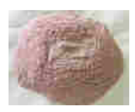
Developed Rajaala flour

The objective of this research is to replace wheat flour with Dioscorea alata ( raja ala ) in flour and bakery industry of Sri Lanka. In here determine the carbohydrate profile and gluten content of Dioscorea alata (raja ala) Then plan to develop value added bakery products and find out the nutritional value of flour and value added bakery products.