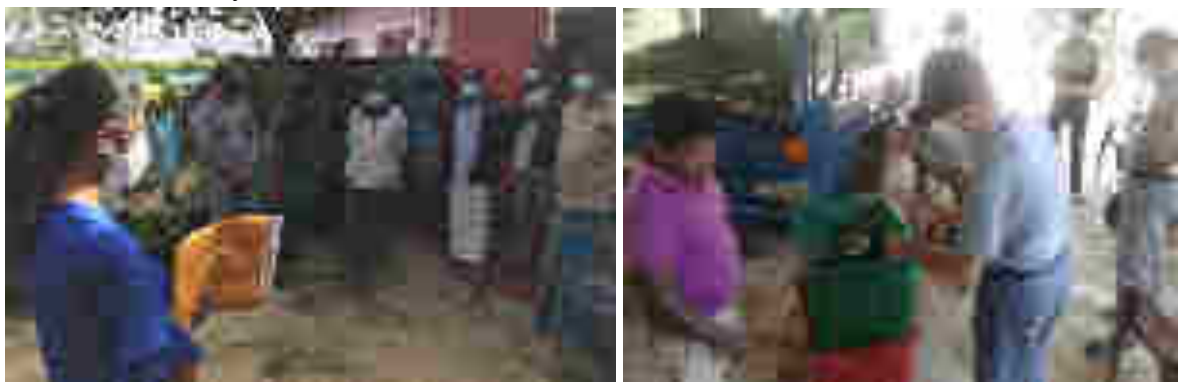
Information gathering from the farmers: project- Developing a technologically sound regional distribution network for fruits and vegetables

The development projects were carried out by the institute in order to ensure technology adoption and their impact on the postharvest industry with special emphasis on agribusiness development and assuring food security. During the year of 2021, nine development projects were conducted by the institute.