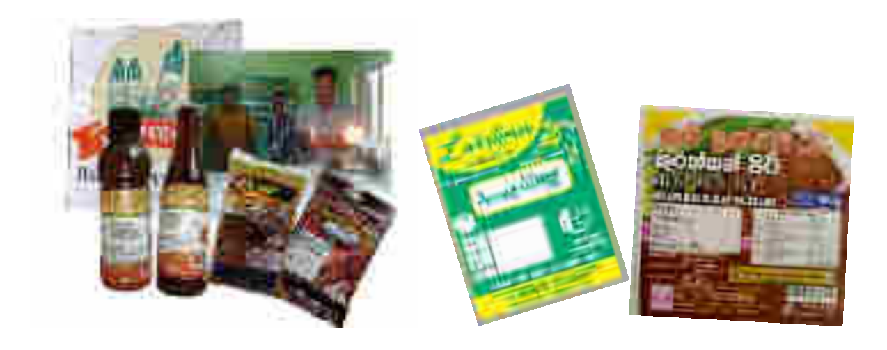
Technology adoption in the field

Further these training of stake holders had contributed to industrial development, economic development and social development with improved living standards as well. Thus, 102 new entreprebeurs were introduced to the agro based industries and these industries include 18 brands of spice based products, 43brands of rice based products, 05 brands of dehydrated fruit products, 32 brands of fruit based products and 04 pulse based producers.