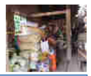
Conducting training progrmmes, onfarm storages before improvements and improved storage facilities