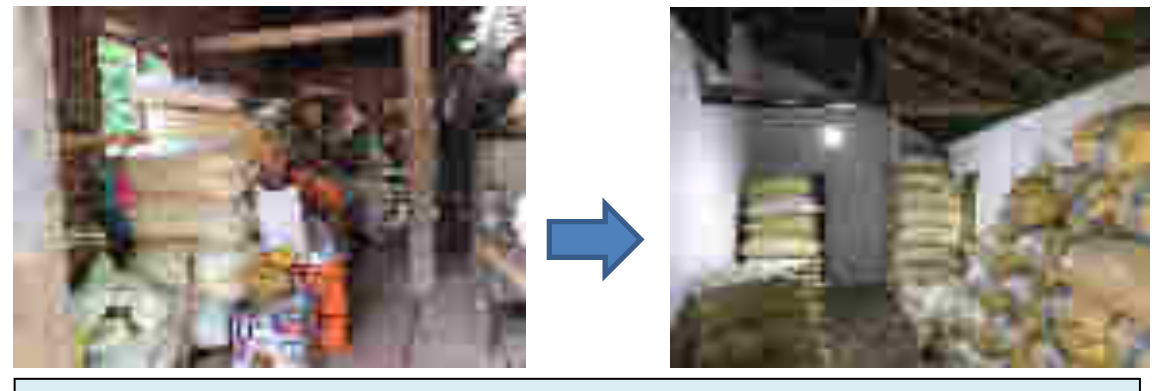
68 on-farm Storages were improved

• Development of on-farm storage facilities of rice, maize and pulses to increase the farmers' income