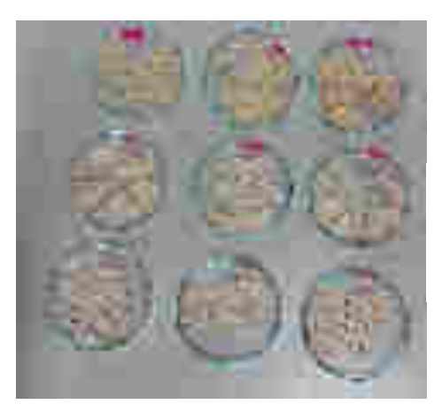
Cooked rice samples of steam heated fresh paddy

Freshly harvested BG 352 paddy was subjected to dry heat treatment, dry heat treatment followed by standard parboiling procedure, steam heat treatment and steam heat treatment followed by standard parboiling procedure. The treated samples were analyzed for physical, chemical and organoleptic parameters. The final output of the study is to cut down the holding costs during natural aging of freshly harvested paddy from present average holding cost of Rs.30 million/ miller. The total financial allocation for the project was Rs Mn. 5.21. The total expenditure from the 01/07/2019 to 31/12/2021 was Rs Mn. 4.75; 2019 allocation and expenditure were Rs. Mn. 0.013 and 0.0126 respectively, 2020 allocation and expenditure were Rs. Mn 5.07 and 4.62 respectively while 2021 allocation and expenditure were Rs. Mn. 0.1235 and 0.123 respectively (Total Financial progress is 91.32%.). Findings of this research cut downs the holding costs of paddy, hence provides more benefits to Farmers and millers. Total Physical progress is 100%