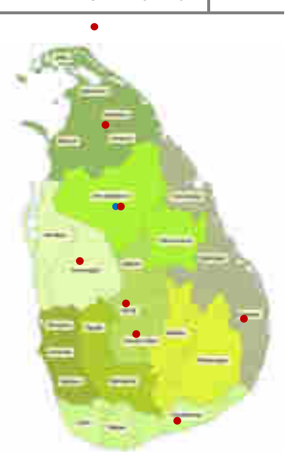
Currently island wide technology transfer activities are covered by 8 extension centers