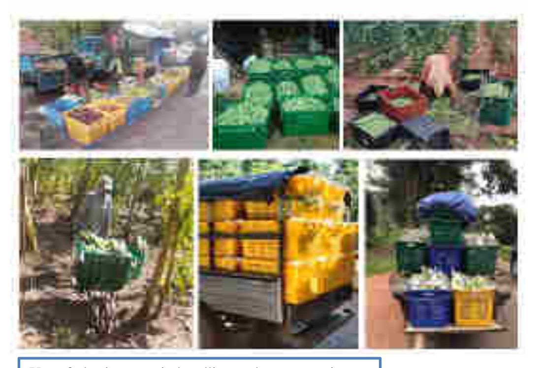
Use of plastic crates in handling and transportation

Serious quantitative post harvest losses and quality deterioration occur during all stages of the horticulture supply chain in Sri Lanka. The results of a surveys and studies conducted have revealed that the post harvest loss in fruits and vegetables range from 30-35% in which highest contribution is given during the transportation due use of unsuitable packaging. Therefore, this project was initiated to popularize the use of appropriate packaging for transportation of fruits and vegetables among farmers, collectors, transporters, whole sellers, retailers. One of the main activities of the project was awareness creation to improve the knowledge of stakeholders; farmers, collectors, wholesalers and retailers on improved postharvest technologies and their applications for fruits and vegetable supply chains in Sri Lanka. The project aimed to provide plastic crates to all the stakeholders of fruits and vegetables supply chain in the country on 70% subsidy basis. During year 2021, 31240 plastic crates under two categories were introduced to stakeholders in major perishables supply chains in Sri Lanka. Using these plastic crates approximately 500 MT of fruits and vegetables are being transported daily. Then, the postharvest losses of some fruits and vegetables have reduced remarkably from 30-40% to 15-20%. Total budget allocation was Rs.Mn. 49.587 for the year 2021 and the total expenditure was Rs. Mn. 49.274. Physical progress 100%.